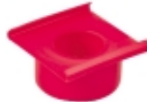
Ø110mm vertical outlet