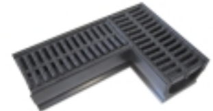
Black corner unit complete with black plastic grating