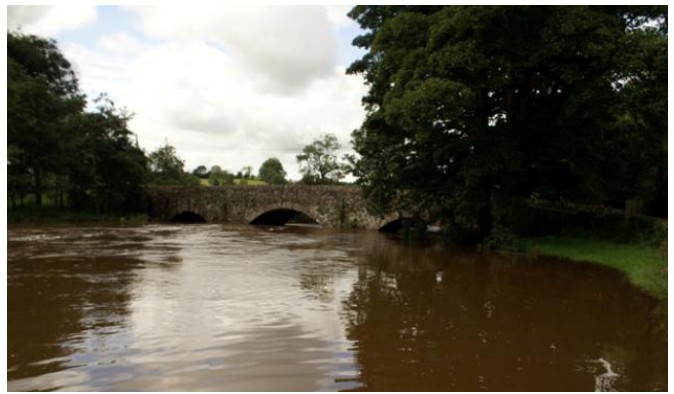
Permeable paving could prevent the erosion of streams and rivers and the subsequent destruction of natural habitats for wildlife.

During heavy rainfall much of the dirt and pollution which builds up on roads, pavements, roof tops, car parks etc is “stripped off” and flushed into the drainage system.