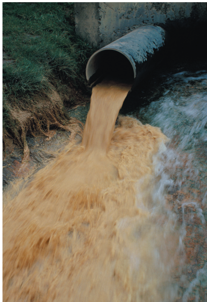
If polluted water is discharged directly into our streams and rivers it poses a significant threat to the environment.

If this water is discharged into our rivers or streams, there is a very real threat of serious damage to the natural environment. Fish, animals, insects and plants will all be threatened.