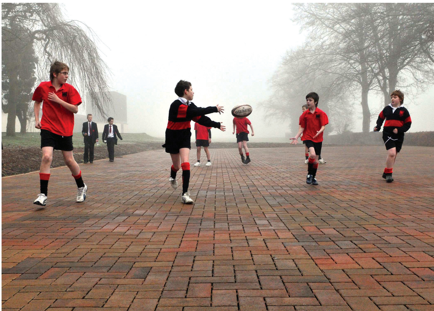
Permeable Paving has the advantage over other SuDS techniques in that it facilitates vehicle and pedestrian traffic as well as recreational activities.