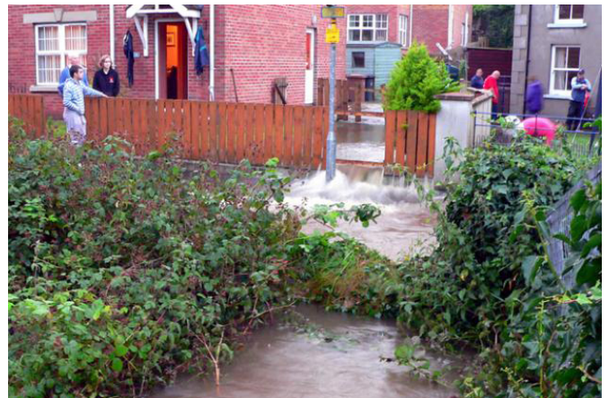
Urban flooding is on the increase as our traditional drainage systems become incapable of handling heavy rainfall in built up urban areas where open ground has been sealed over